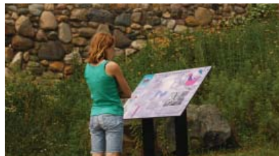
This sign interprets the stone bridge in the background, the glacial origins of its stones and how the stones were cleared from farm fields by the first settlers.

Not only will site focus maintain interest, but it will keep the word count down to a manageable size. Due to limited space on a sign, branching beyond the site story will make the sign too wordy and you will lose reader interest. Generally, one main point with two or three supporting points is more than enough to fill the limited space.